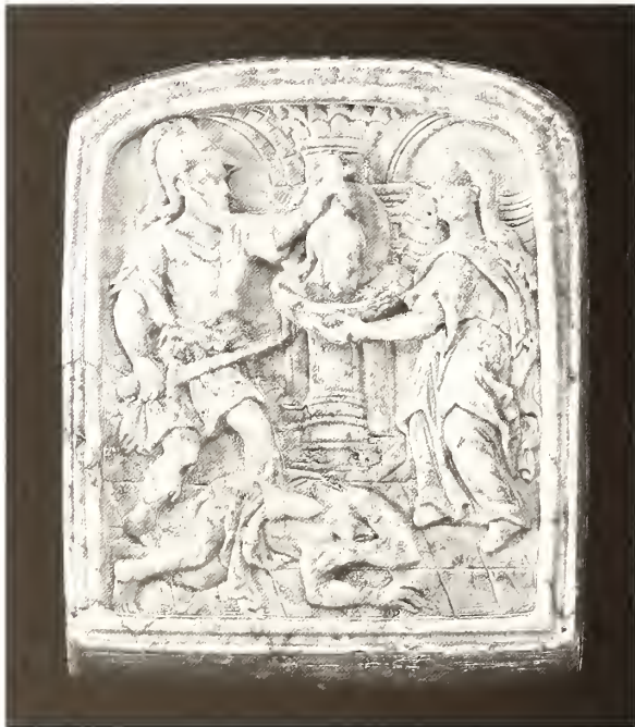
Figure 17. Solomé Receives the Head of St. John the Baptist , after Jost Amman (1539–1591). India, Mughal period, Akbar period, ca. 1580. Stone, 6.1 x 5.2 x 4.1. Private collection

and other statuary. Some of the sculptures commissioned by Akbar and subsequently Jahangir were monumental. 26 The artists also produced small pieces of jewelry and stone plaques depicting Christian scenes for the emperor's personal collection. One of the plaques—a miniature bas-relief sandstone carving (see fig. 17) after an engraving of The Feast of Herod by Jost Amman (1539–1591; see fig. 18)—reproduces its model in reverse and in three dimensions; this was quite an accomplishment for artists who had just begun to explore the new style. 27